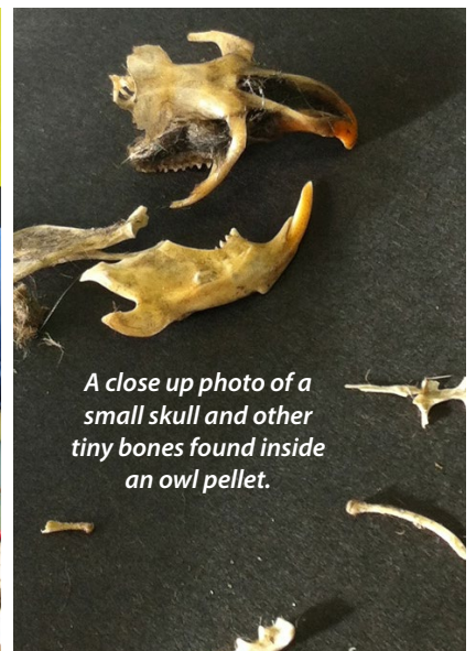
A close up photo of a small skull and other tiny bones found inside an owl pellet.